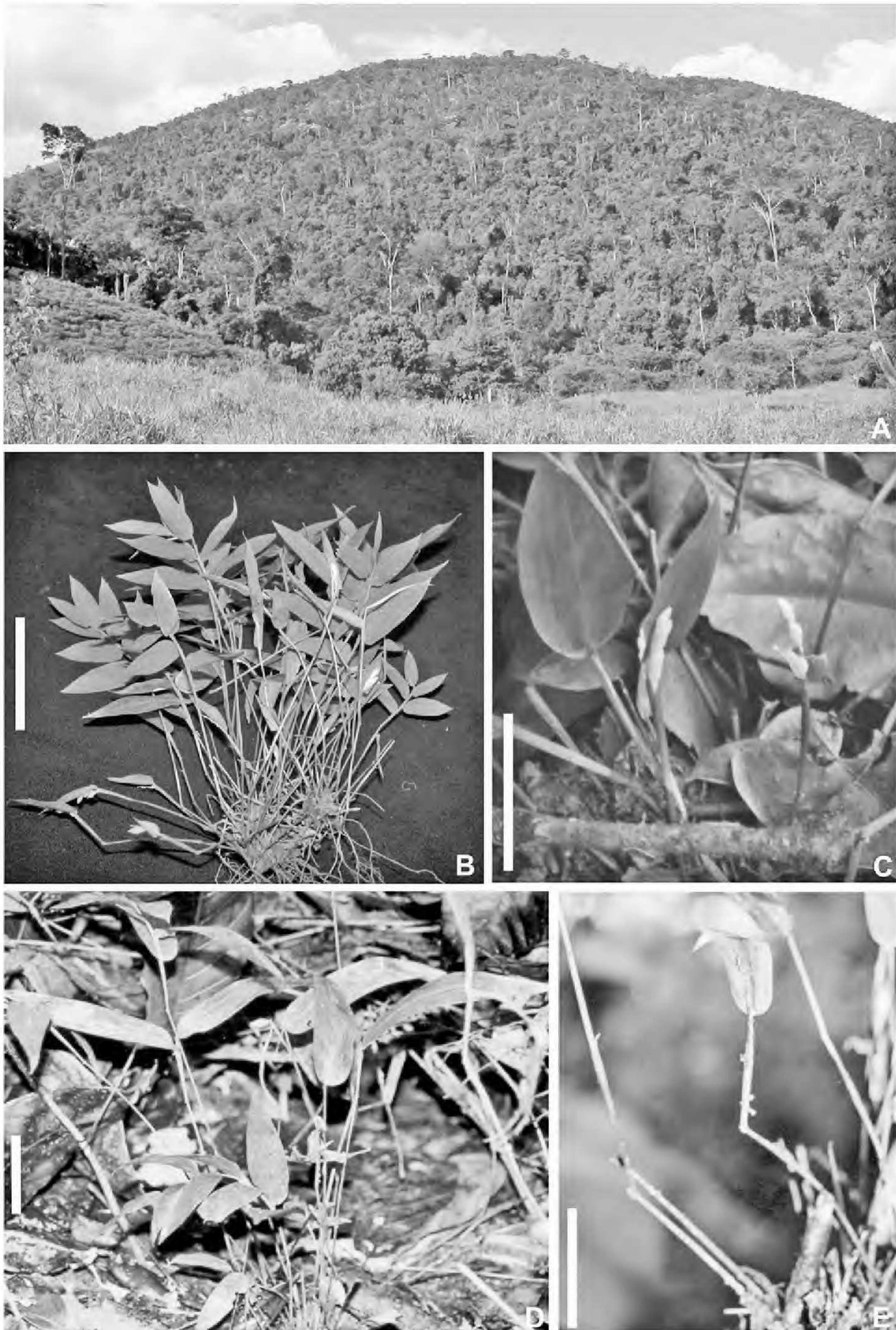
Figure 1. —A. Atlantic mesophyllous forest at Itanhém, Bahia, Brazil. —B. Diandrolyra pygmaea . —C. Diandrolyra bicolor . —D, E. Diandrolyra tatianae . Scale bars = 5 cm.

described, D. bicolor Stapf (Fig. 1C), occurring in Bahia, Espírito Santo, and Rio de Janeiro states, and D. tatianae Soderstrom & Zuloaga (Fig. 1D, E), which has a wider distribution, known from São Paulo, Rio de Janeiro, Espírito Santo, Minas Gerais, and Bahia